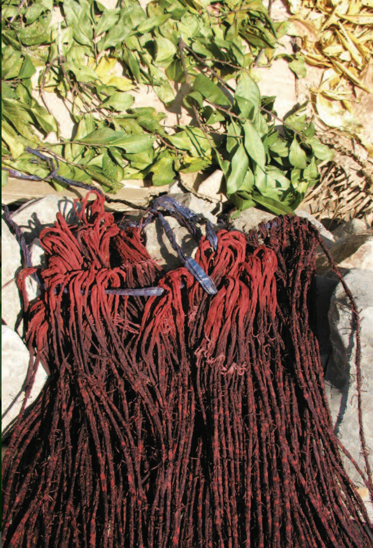
ABOVE: Morinda-dyed threads with Symplocos leaves used in the mordant process.